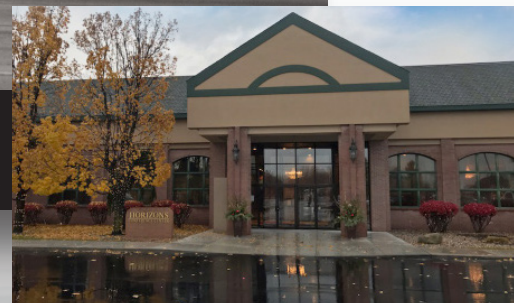
Newcomers to the spacious, spectacular facility are often astounded when they learn about its humble beginnings.