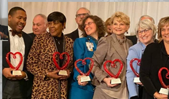
Michigan Banner has hosted its Heart of the City Community Awards program at HORIZONS since 2017.