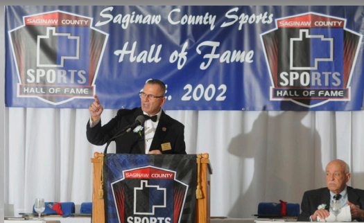
The Saginaw County Sports Hall of Fame has held its annual banquet at HORIZONS for many years.