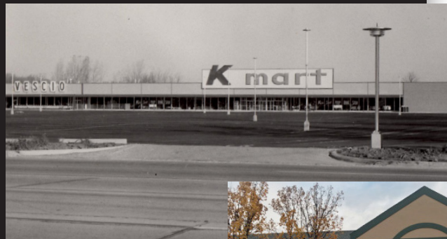
Kmart store #4038, circa 1963, decades before its transformation to HORIZONS Conference Center.

Since 1996, HORIZONS has hosted thousands of weddings, anniversary celebrations and other events to mark life’s most important milestones – as well as thousands of conferences, trade shows, retirement celebrations, and a wide range of corporate and community gatherings. HORIZONS team members form deep connections with their clients and guests and are an integral part of the planning process, creating memorable experiences that have people coming back again and again.